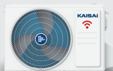
Outdoor unit KWX